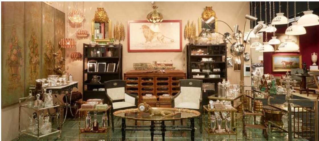
Bar ware and drinks trolleys, shop cabinets, unusual light fittings can be found throughout the Fair, here at Dee Zammit