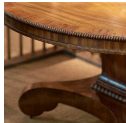
Exquisite displays of unusual collectors' items are found throughout the fair, this at Stothert & Trice , dealers in textiles, ethnographic & tribal art; pretty and practical vintage glass at Geoffrey Stead ; the return of beautiful 'brown' furniture