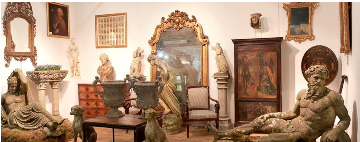
Classic country house antique furniture, mirrors and statuary at Vagabond