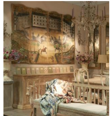
Su Mason vintage & antique textiles; Dorian Caffot de Fawes C20th design; Maison Artefact Swedish & French antiques