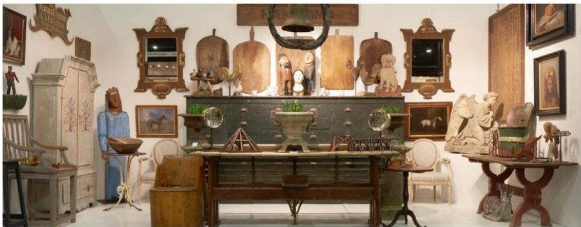
Country antiques and accessories are popular; this shows The Home Bothy