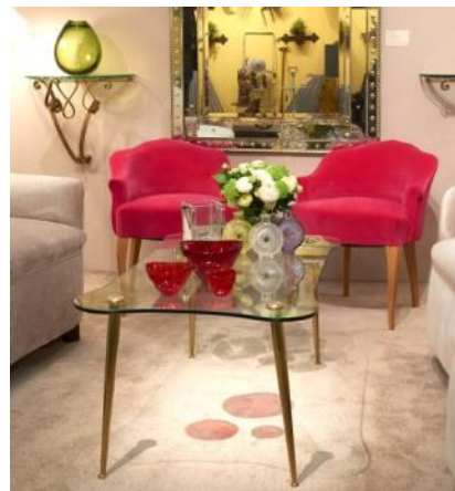
Vintage & antique Swedish & oriental rugs at Joshua Lumley; C20th salon furnishings at L&V Art and Design